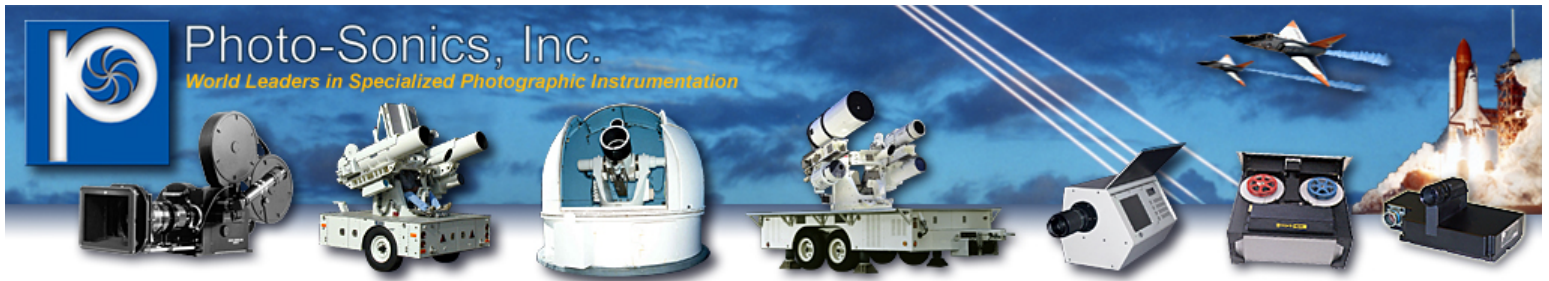
Photo-Sonics, Inc. is pleased to announce that we have been selected by the Small Business Administration as the Prime Contractor for the Year for Region IX* .