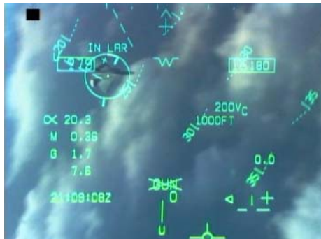
F/A-18 HUD Symbology engaged in Dogfight.

For additional information please contact: